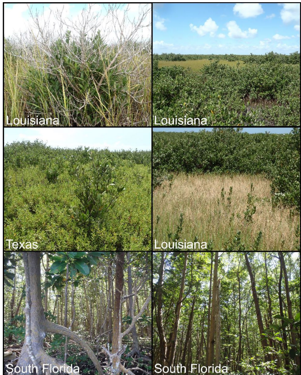
Fig. 1 Mangroves growing near freeze-prone range limits are often shorter, wider, multi-stemmed, and more shrublike (see shrubs in upper and middle panels) compared to their tropical counterparts growing in freeze-free, resource-rich environments (see trees in lower panels). Due to these morphological differences, methodological refinements are needed to adequately characterize the structure, function, and abundance of mangroves near poleward range limits. Avicennia germinans (black mangrove) is the species shown in the upper and middle panels. The lower panels also include the other two common mangrove species in this region— Rhizophora mangle (red mangrove) and Laguncularia racemosa (white mangrove). The damage and recovery in the upper left panel are due to a freeze event.